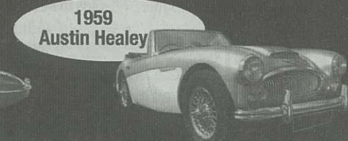
1959 Austin Healey