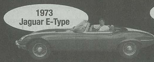
1973 Jaguar E-Type